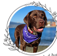
Accompanied by Therapy dog SEVEN